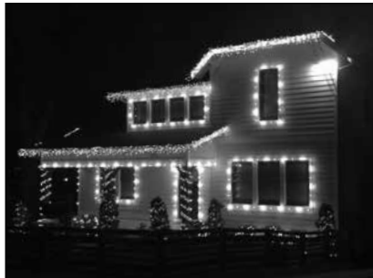
2nd Place: 317 S. 14th St.