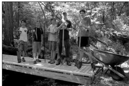
Lockeland Springs Park

A recognition that the changes happening throughout the neighborhood are not all bad; with them come new people that are equally excited to be a part of the best neighborhood in Nashville.