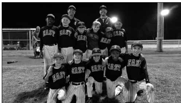
East Nashville Little League was one of three recipients in the annual LSNA grant program.