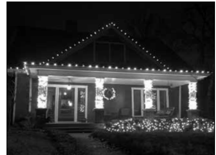
3rd Place: 407 N. 16th St.

The LSNA launched a new series of contests last year for beautification, restoration/infill, and holiday lights — which proved most popular! The board drove the neighborhood to see each nominee before voting. Thank you to everyone who participated and we know the winners will enjoy their gift cards to Margot and Marche. Next up will be the Beautification Awards. Look for details soon.