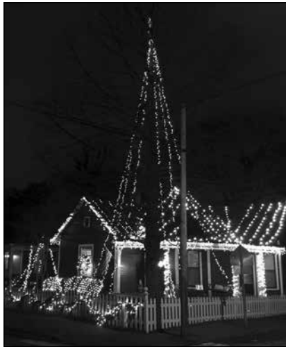
1st Place: 1623 Woodland