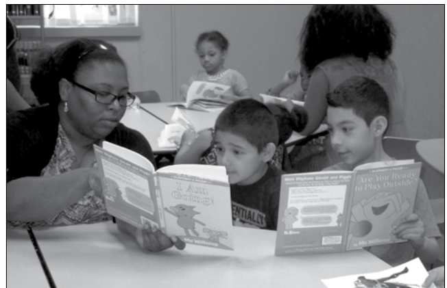
The East Nashville Hope Exchange, pictured above, has received LSNA grants for literacy programming in recent years.