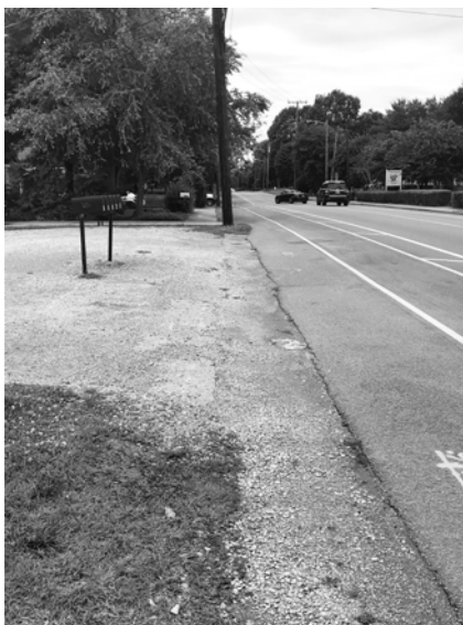
The location of the proposed sidewalk on Eastland Ave. @ Rudolf looking west towards 16th.