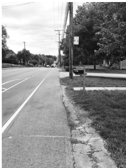
The location of the proposed sidewalk on Eastland Ave. @ Rudolf looking east towards 17th.

Councilman Withers shared that the next section of sidewalk construction, currently in the planning stages, is the south side of Ordway Place, between N 16th Street and N 17th Street. You can check the status of sidewalk projects citywide using this online tool: https://mpw.nashville.gov/sidewalks/